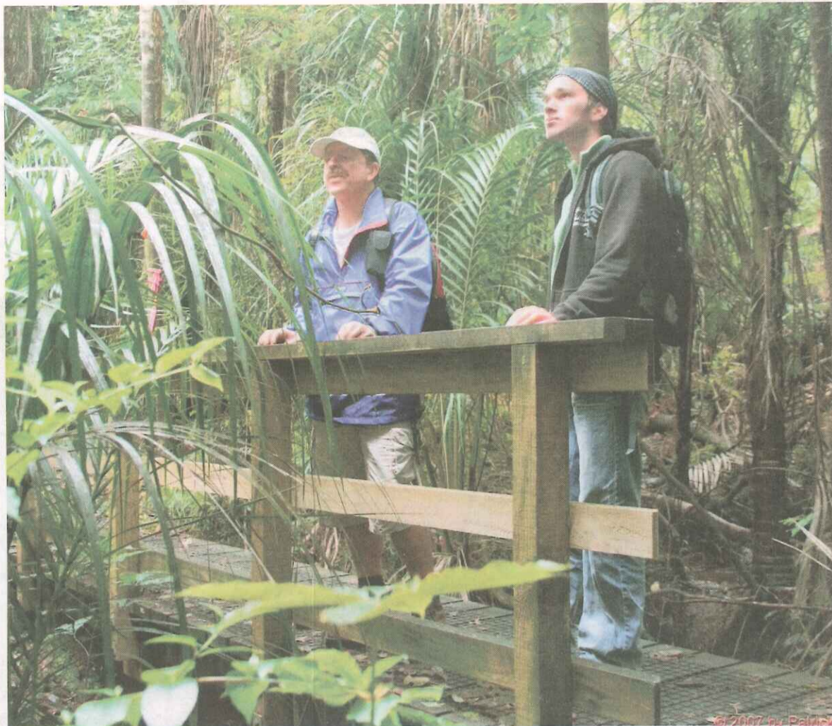
From top: Adventure Puketi takes walkers deep into the forest; the 35 Degrees Aquarium and Bar on the waterfront; views from the Sea Spray Suites at Paihia.

Excellent coffee can be found at Cellini's Gelateria & Espresso kiosk on Williams Rd, where locals buy their takeaway coffee.